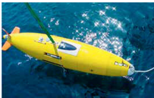
Figure 2: AUV "Abyss" micro-bathymetry system was used to map fault escarpments at unprecedented resolution.

Fault investigations have focused in the past on the active structures located at the external part of the Gulf of Cadiz, which correspond to active NE-SW trending west-verging folds and thrusts of the Marques de Pombal Fault, Horseshoe Fault and Coral Patch Ridge Fault (Gràcia et al. 2003, Zitellini et al. 2004, Terrinha et al. 2009). In addition, long WNW-ESE dextral strike-slip faults referred as SWIM Lineation's have recently been identified (Zitellini et al. 2009, Terrinha et al. 2009, Bartolome et al. 2012) (Fig. 1).